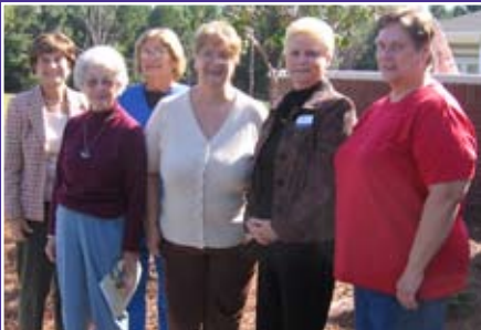
Fair Bluff Methodist Church members brought lunch for staff and patients' families, toured Angel House, and learned about agency services.