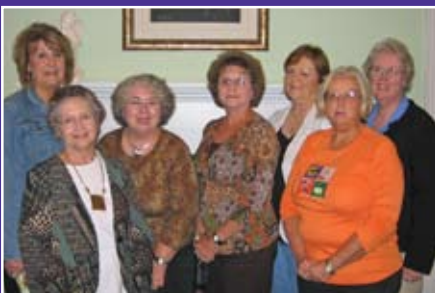
Tomorrow's Club members brought goodies, toured the facility, and listened to a presentation about hospice services.