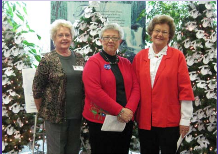
Festival of Trees volunteers in front of the memorial trees they decorated. Each dove ornament commemorates a hospice patient served the previous year. After the holidays, the ornaments were mailed to the patients' families.