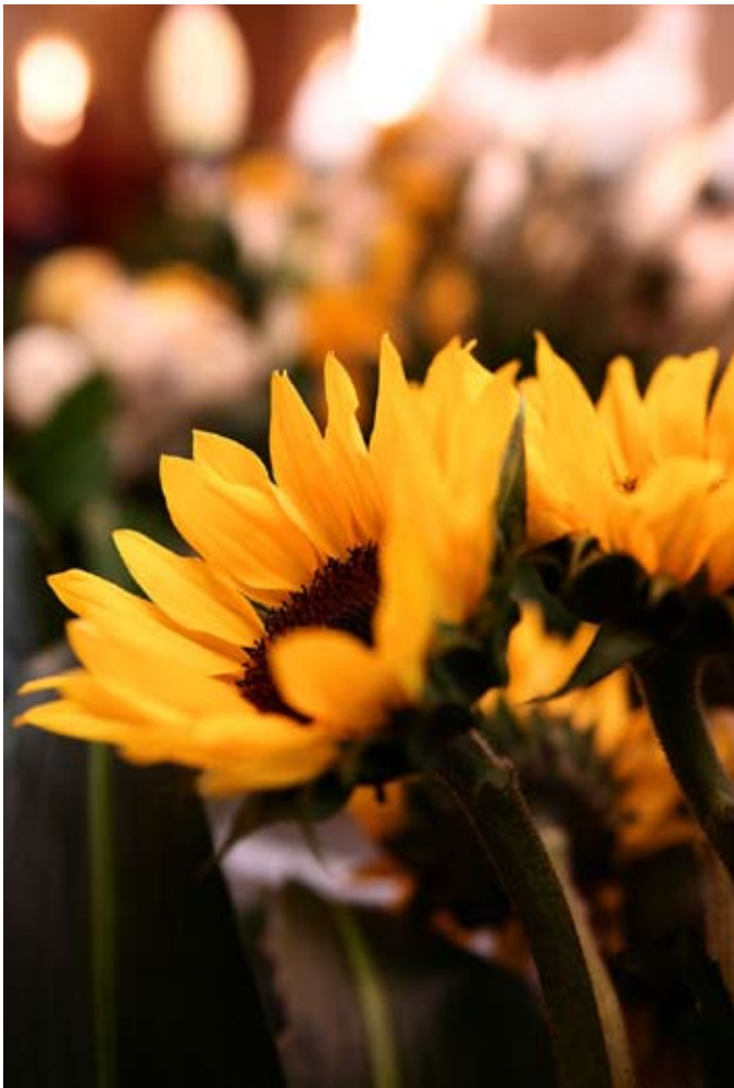
Festival of Flowers 2011