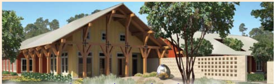
Brunswick County Hospice Care Center Rendering